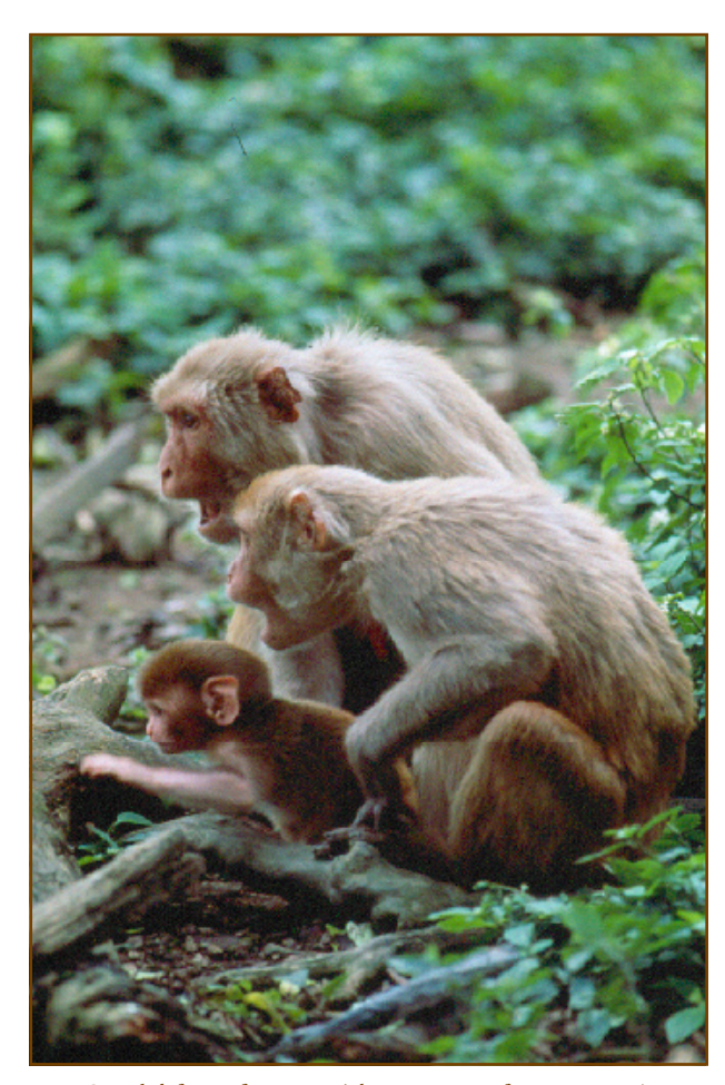
Social defense of territory (photo courtesy of K.Rasmussen).

The reproductive cycle of macaques is characterized by a seasonal estrus period, with menstrual cycles occurring throughout the year. Females have been reported to begin cycling as early as approximately 1.5 years, although a more typical age is 2.5 years. Most species of macaques exhibit swelling and reddening of the skin of the rump, perineum, and occasionally arms, legs and face (referred to as "sex skin"). The swelling and reddening becomes more pronounced from beginning to end of the