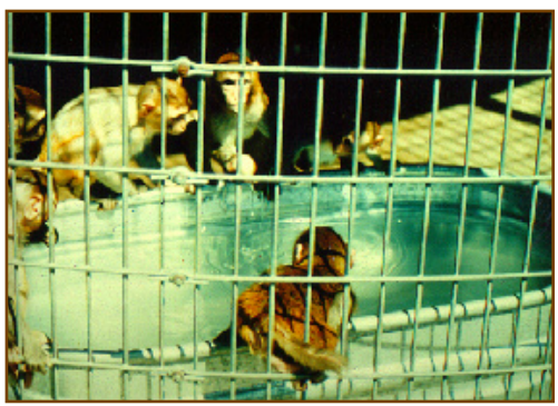
A horse water trough, shown here, serves as a swimming pool for young macaques.

digits to frostbite. This problem can be reduced or prevented by providing them with supplemental heating or a shelter.