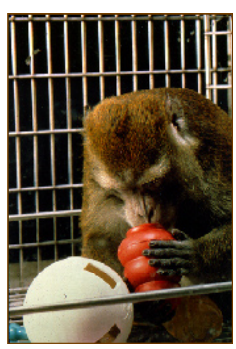
Wedging food treats inside a Kong® toy is another way to extend the animal's time spent in "foraging".

A very successful way to fulfill these animals' inclination to explore and investigate is to give them the opportunity to forage (or search) for food. Since many primates will spend up to 70% of their waking hours in foraging-related activities, offering captive primates the opportunity to engage in this behavior can be important in preventing the development of abnormal behaviors. Numerous in-house and commercially produced devices are avail-