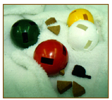
Food treats may be dispensed from puzzle balls (photo courtesy of K. Bayne

and S. Dexter). able, including toys that simply hold the food item and require the monkey to fish for or push it out. Also available are containers with finger holes or slots through which the monkey removes the food item, as well as puzzle boards in which the monkeys must manipulate the food item though a maze before it reaches a hole large enough from which the food can be retrieved. Food may be hidden throughout the enclosure to encourage search-