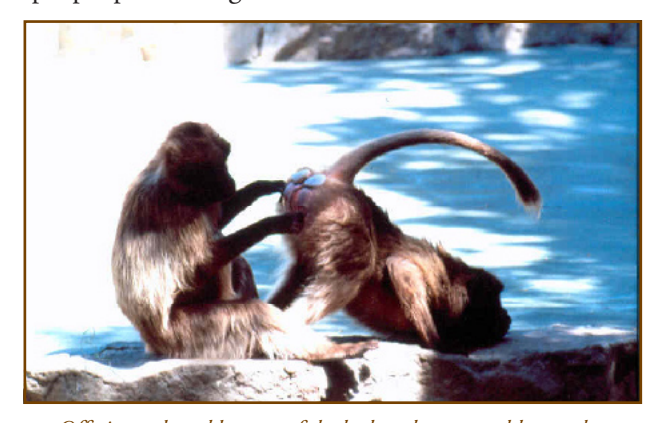
Offering vulnerable areas of the body to be groomed by another animal indicates a degree of trust and affiliation between the animals.

Using the natural social structure of the macaques will assist in forming compatible