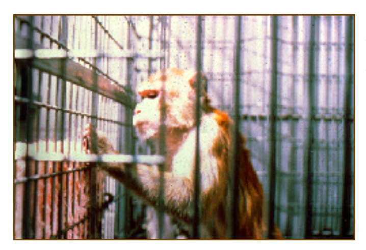
This animal forages for food "crumbles" in an artificial shearling foraging/grooming board.