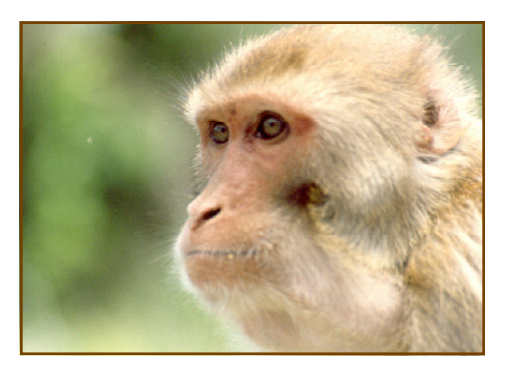
Rhesus (Macaca mulatta) monkey with cheek pouches full of food (photo courtesy of K. Bayne).

In general, the macaques have a medium-sized body, with a stocky build. Animals belonging to the smallest species weigh approximately 13 pounds, while representatives of the largest species weigh an average of 40 pounds. Tail length varies among the different species. All macaques have long, sharp canine teeth and finger nails that can pose