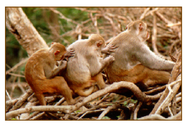
Social grooming is an integral part of forming affiliations.

Because these animals rely in large part on visual communication, they use a number of facial signals, often accompanied by vocalizations, to threaten or to make friendly overtures. Threat displays include opening the mouth in the shape of an "O", a direct stare, raising the eyebrows quickly and repeatedly,