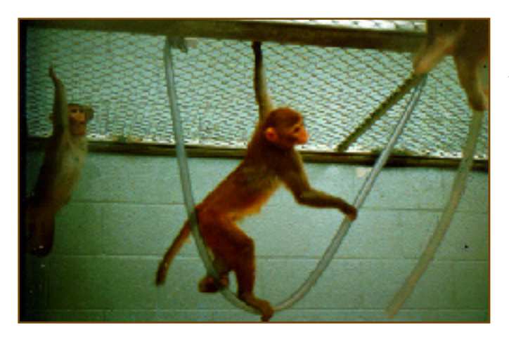
Flexible PVC tubing can be installed in the primary enclosure to simulate branches for swinging.