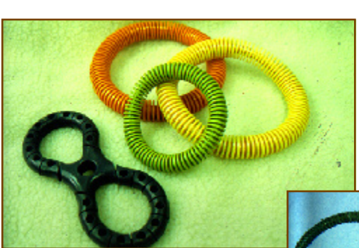
A variety of toys used with macaques (photo courtesy of K. Bayne and S. Dexter).

The macaques are curious and intelligent animals. Providing them with opportunities to investigate and explore their environment is enriching for them. This can be accomplished by maintaining toys in the animals' enclosures. Since macaques have color vision, the toys (also known as manipulanda) should be of different colors; they can also be of different shapes and texture. Because the monkeys will chew on these toys, they should be relatively durable, such as heavy-duty dog toys. Toys should be removed from the enclosure when they become sufficiently damaged that the primate might swallow or choke on a piece. Rotating different toys in the enclosure and removing them periodically will help to keep the toys novel and increase the animals' interest in them.