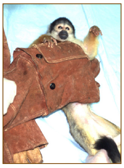
Use of a leather glove for manual restraint of a squirrel monkey.

While it is unlikely that infectious diseases would transfer from squirrel monkeys to humans, and vice versa, common-sense precautions should be taken when working with any animal: