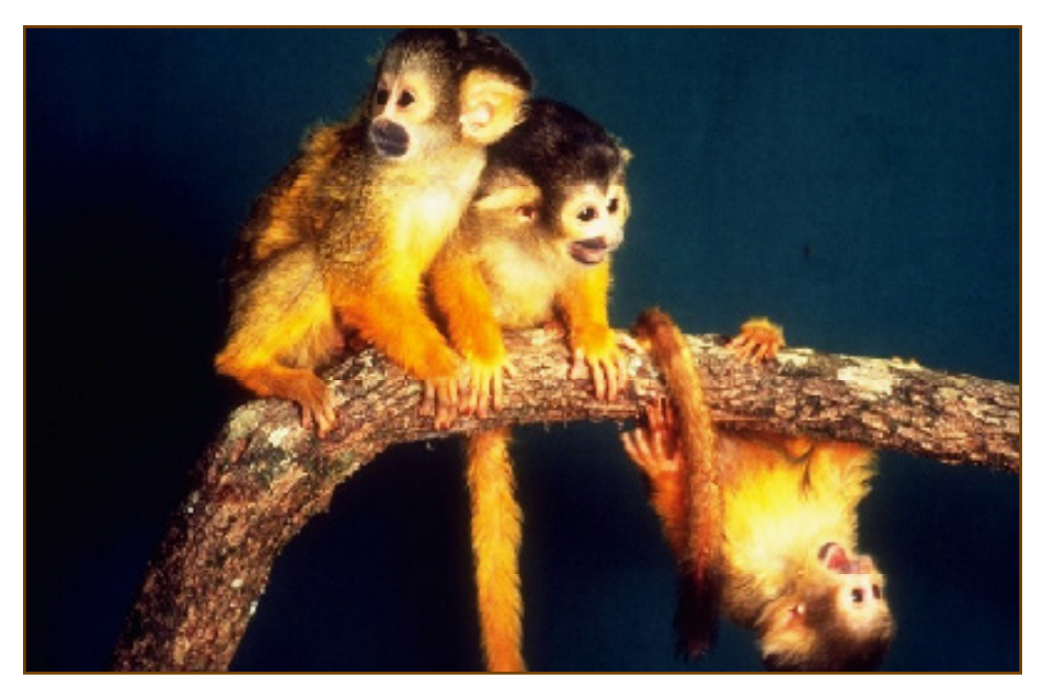
Wooden branch used as a perch.