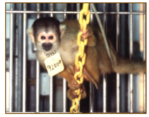
A plastic chain swing.

Animals housed in indoor cages, on the other hand, have a limited ability to regulate their exposure to animals housed in other cages by positioning themselves in such a way as to limit their ability to view other animals. Cage configuration will determine the number of monkeys that can be housed. Rack caging can be used to house small groups, pairs, or single animals.