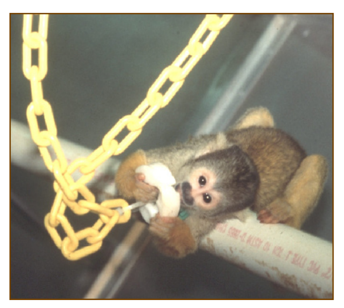
Food items can be suspended, to make them more challenging to consume.

Occasionally, squirrel monkeys can experience anxiety when exposed to novel stimuli. Care must be taken, particularly with animals in smaller enclosures, to ensure that changes are not distressing to the animals. Animals should be observed after introduction of new objects to determine whether they show signs of fear or avoidance of the object. If this occurs, the object should be