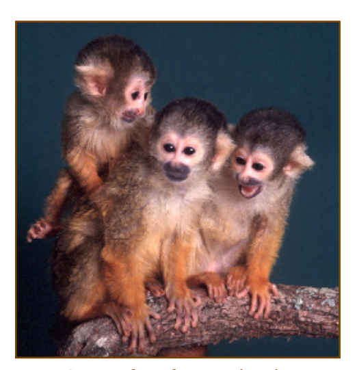
Carrying of an infant squirrel monkey.

Consideration of the needs of squirrel monkeys in captivity should extend beyond their basic physiologic requirements. These animals possess a host of behaviors that define their species. Putting forth the effort to enhance psychological and physical well-being of squirrel monkeys is essential to meeting the needs of this species. Through a well-conceived plan of environmental enrichment, good husbandry practices and a sound program of veterinary medical care, anxiety and boredom can be alleviated and natural behavior typical of this species can be promoted.