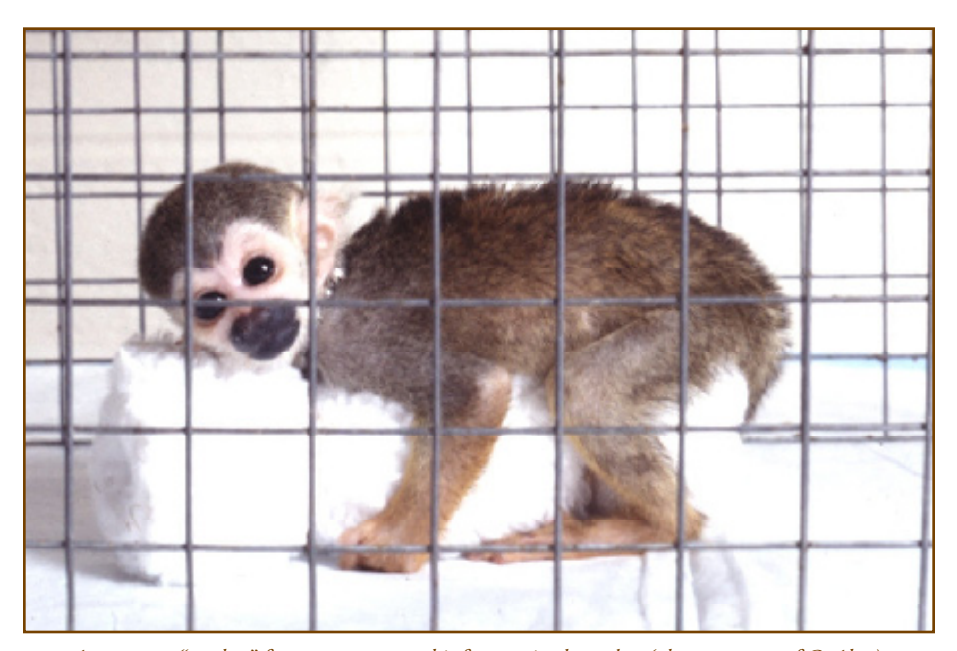
A surrogate "mother" for a nursery-reared infant squirrel monkey.

If possible, infants and young juveniles should be housed with their mothers and remain within their natal social group. Attempts should be made to find appropriate foster-mothers for newborn infants that are rejected or orphaned. Failing this, or if the newborn is clinically compromised and unable to cling normally to a female, it can be housed in a separate nursery. Nursery infants can be housed in small, wire-mesh cages. They should be given a cloth surrogate mother approximately the same diameter as an adult female monkey to provide contact comfort. Infants in the nursery need frequent, positive contact from the caregivers as part of the feeding schedule. This contact varies from every hour to every four hours depending upon the age of the animal. As the infants grow older and strong enough to interact with other infants, they can be moved to a larger enclosure with other similarly aged infants. The cage should be equipped with multiple levels of perching and swings for the animals to move and jump from one to the next. When nursery-reared infants become old enough (6 - 12 months of age) to eat on their own and move about within a social group with adults, they can be introduced into a social group within the general colony.