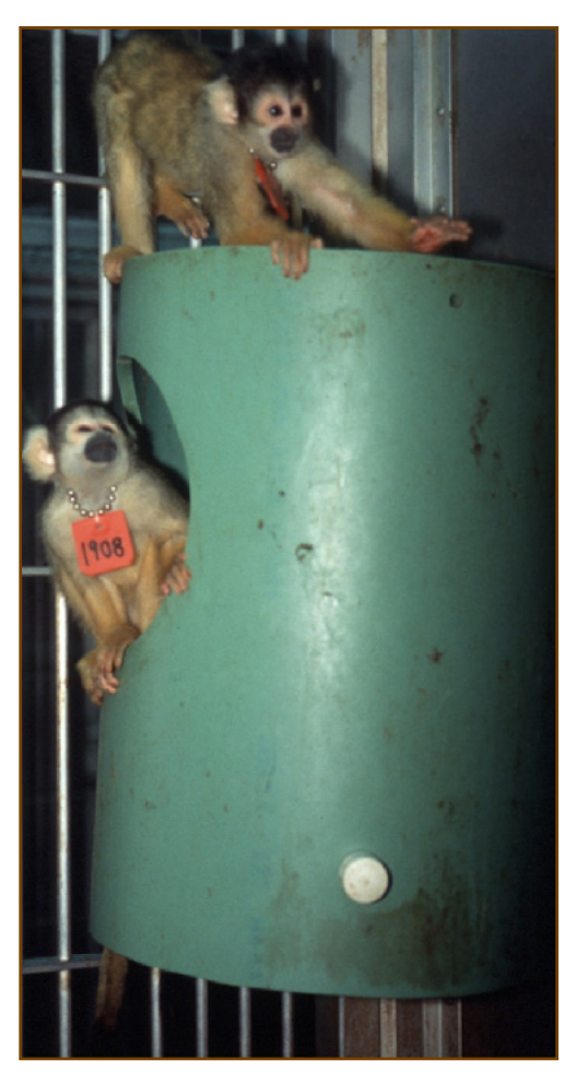
A hiding area for squirrel monkeys.

Both indoor and outdoor group pens can be designed for squirrel monkeys. Physical comfort of the animals is important in reducing stress and promoting the well-being of colony members. Animals in outdoor pens have the opportunity to control aspects of their environment by moving through their pen (e.g., sun or shade). The animals are generally free to seek the place they wish to spend their time. Animals in these pens can also self-regulate the amount of exposure to other animals by moving within their pen. Perches should be positioned at several levels within the living area for climbing and jumping. These perches can be constructed of PVC pipe, which is impervious to water, easily cleaned and not highly thermoconductive. Wood perches can also be used as long as they are replaced once they become exces-