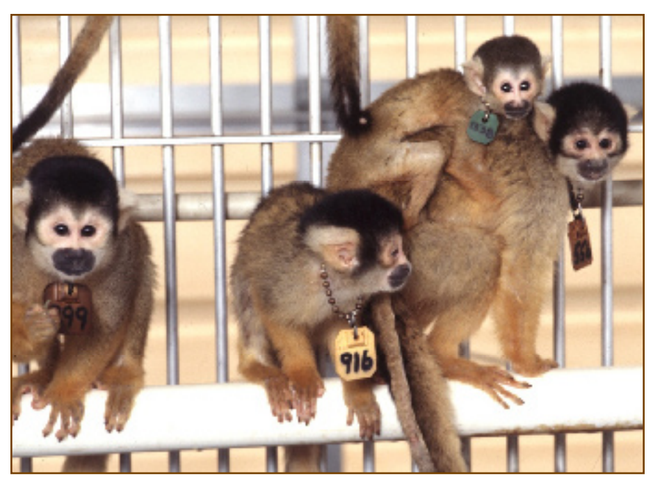
A social group of squirrel monkeys (photo courtesy of C. Abee).

fighting may develop among males if more than two are housed together within the social group. Most of the time, females of varying ages can be housed in social groups of two or more with only occasional difficulties with incompatibilities of group members. In fact, housing multiple females per group provides breeding animals the social structure necessary to reproduce efficiently. To maximize breeding efficiency, as many as 20 females can be housed with a single male. An optimal ratio, however, is one male per eight to ten females.