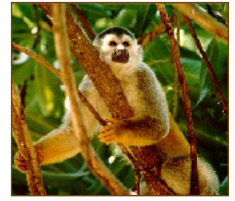
Squirrel monkey in a complex, naturalistic environment (photo courtesy of C. Abee).

The male squirrel monkey weighs approximately 550-1135 grams, while the female weighs from 365-750 grams. The male exhibits an increase in body weight-- particularly in the arms, shoulders and trunk of the body-- during the breeding season, referred to as the "fatted male" syn-